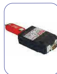
PEN drive Adapter